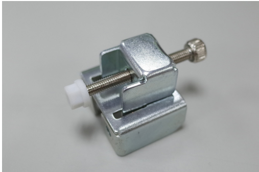
Clamp + Holder

The following table lists the number of each component contained in the FPK series package.