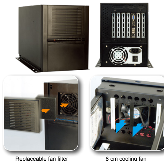
Replaceable fan filter

CD-ROM and HDD are not included in package.