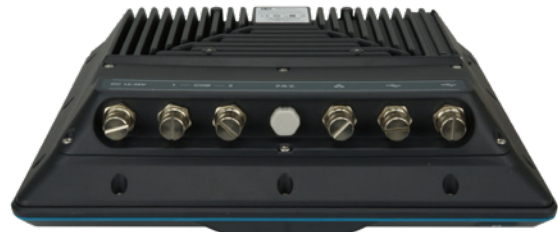
M12 IO cover