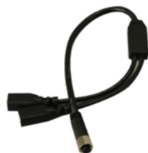
USB cable (CB-M12USB02-R20)