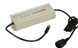
Water-proof Power Adapter (63040-030080-000-RS)