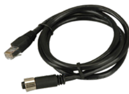
RJ-45 LAN cable (CB-M12RJ45-R10)