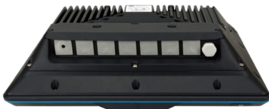
Standard IO cover