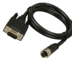
DB-9 COM port Cable (CB-M12COM-R20)